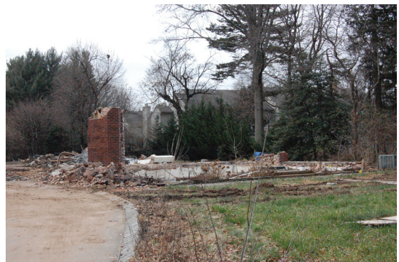
After: 31 Woodbridge Avenue

The Metuchen-Edison Historical Society provided some details about the loss of so many Metuchen vintage homes and, specifically, the history of 31 Woodbridge Avenue: