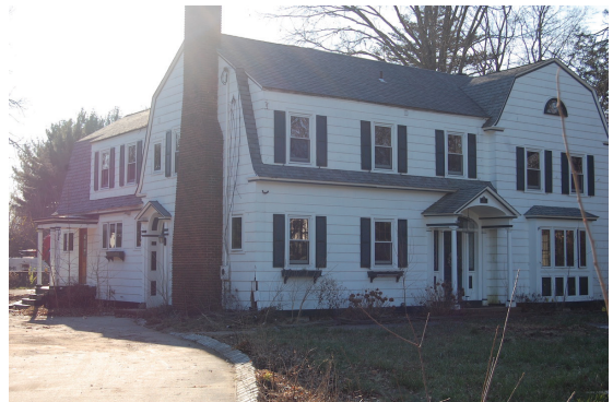
Before: 31 Woodbridge Avenue